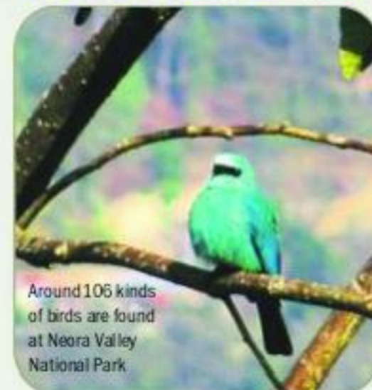
Around 106 kinds of birds are found at Neora Valley National Park