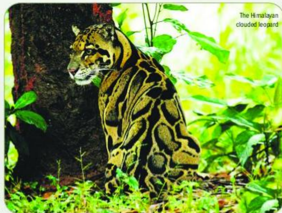
The Himalayan clouded leopard

As 20 per cent of mammals found in the Neora Valley National Park have been declared highly endangered, Unesco has included this forest in its list of tentative world heritage sites.